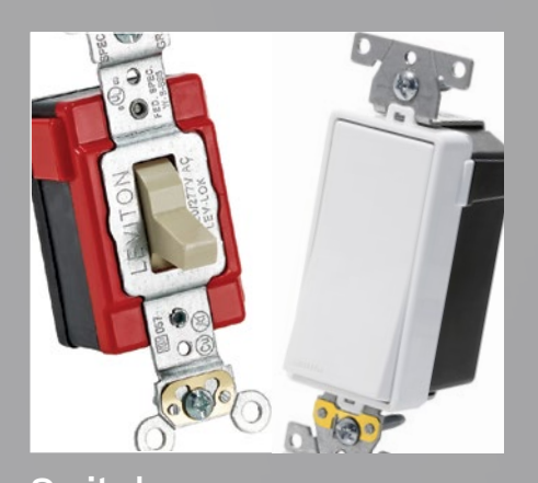
Switches Toggle and Decora Plus™