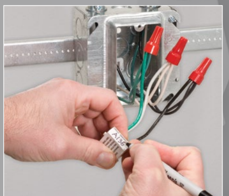
Install Wiring Module

All modules have a Circuit ID Label for ease of identification