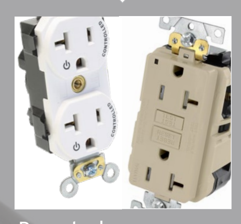
Receptacles Standard Duplex and Decora Plus™, GFCI, USB & Surge Protective