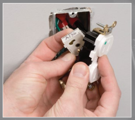
Connect Wiring Device

All modules have a Circuit ID Label for ease of identification