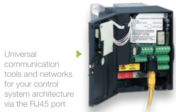
▶ Universal communication tools and networks for your control system architecture via the RJ45 port