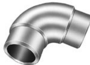
WLI90 Series Tube to Tube, 90 Degree Aluminum Weldment Couplers