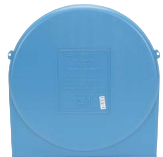
3M™ EMS Full Range Marker Suited for deep applications of up to 8–9'