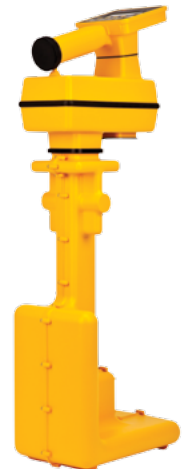
3M™ Dynatel™ iD Marker/EMS Tape Locator 7420