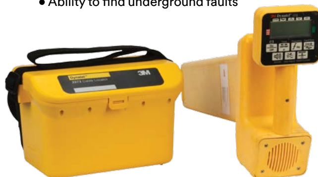
3M™ Dynatel™ Locator Features by Model