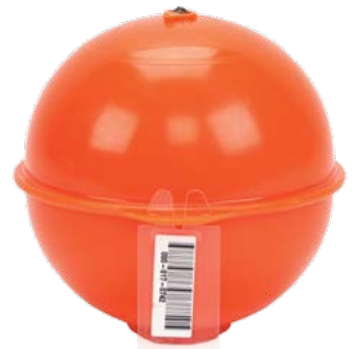
3M™ EMS Ball Marker Self leveling feature, suited for depths of 5–6'