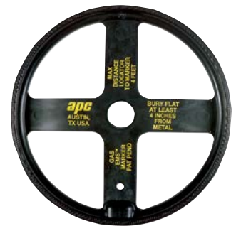
3M™ EMS Mini-Marker Designed for maintaining a stable position after placement at depths of 6'