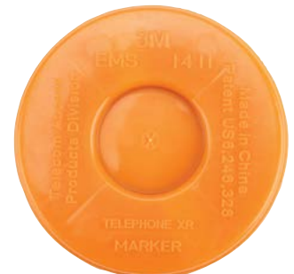
3M™ EMS Disk Marker Ideal for marking at shallow depths of 3–5'