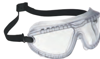
3M™ Lexa™ Splash GoggleGear™

Lightweight, low-profile splash goggle with adjustable lens angle.