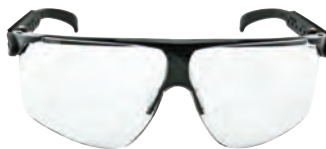
3M™ Maxim™ w/RAS

RAS (rugged anti-scratch coating) – for tough environments that require extremely scratch-resistant lenses.