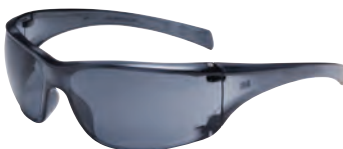
3M™ Virtua™ AP

Graceful unisex styling and integral sideshields.