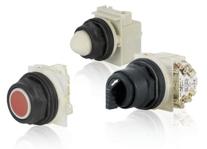
Double insulated, corrosion resistant 9001SK plastic bezels for oil, water and chemical applications (Rated IP66, Types 4X and 13).

With easy-to-install and identify features, the Harmony 9001K and 9001SK products deliver high performance and maximum flexibility to meet your most challenging requirements. Modular design and side-by-side mounting capability allow to optimize panel space and save installation time and costs.