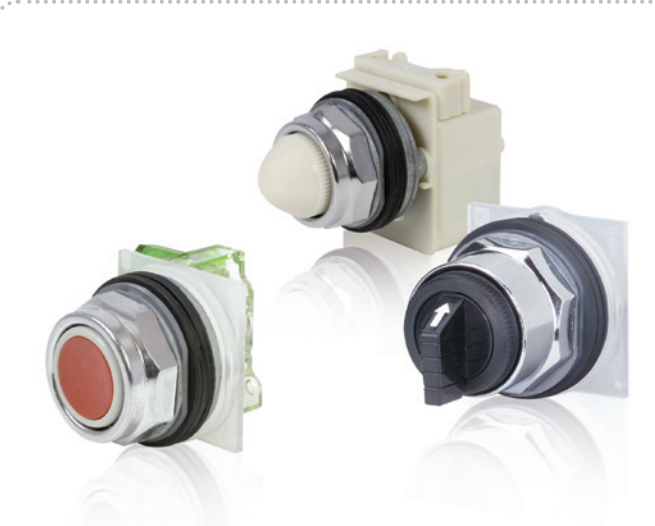
Attractive 9001K chrome-plated bezels for most robust applications (Rated IP66, Type 4).