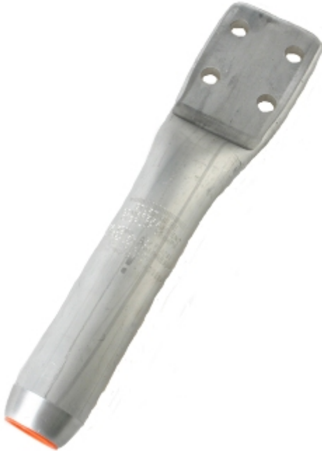
Compression Terminal, Uni-Grip, Jumper Terminal, Straight, Conductor Range, Range 1.806-1.900