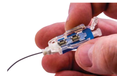
Insert and Click

Note: See color chart on page G2. For termination tools and accessories, see page G18. Cleave tool OFCLV3 suitable for multimode only. Visual Fault Locator OFVFLKT1 recommended during termination. Precision cleave tool OFCLV5 required for singlemode terminations. Use precision cleave tool for optimum performance.