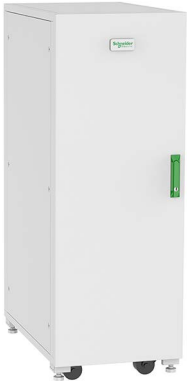
Modular Battery Cabinet