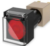
Cold Start Kit