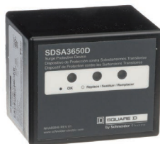
SurgeLogic™ Type SDSA