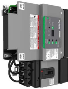
I-Line™ SurgeLogic SPD Unit