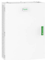
Maint Bypass Panel