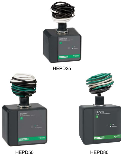
Table 6.1: HEPD Whole House Surge Protective Devices