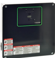
SurgeLogic™ Type EMA