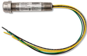
SSE Signal Protection

SurgeLogic SSE suppressor provide multi-stage surge protection designed for water and wastewater flow meter control applications, encapsulated in stainless steel pipes for quick installation.