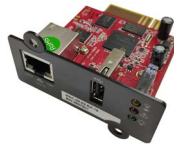
Series Network Card