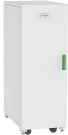
Modular Battery Cabinet