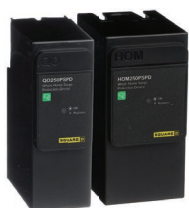
Square D™ QO / HOM PoN SPDs