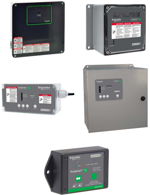
Table 6.7: Enclosed SPDs