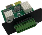
Dry Contact Card