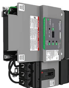
SurgeLogic™ Type IMA