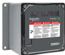
SurgeLogic™ Type EMB