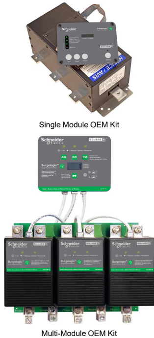
Table 6.4: OEM/Assembler Kits

US and Canadian UL Recognized to UL 1449. Complies with requirements of NEC Article 285 and CSA 22.2 No. 8-M1986, as appropriate. Complies with UL 96A Master Label requirements for Lightning Protection Systems.