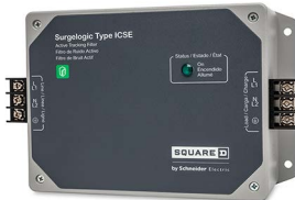
ICSE Series Filter