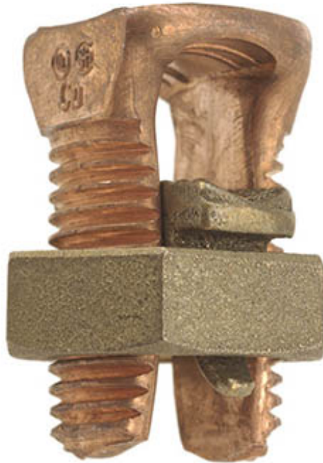
Copper Split Bolt Connector