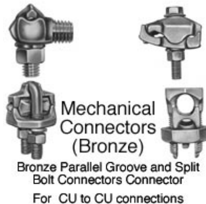
Mechanical Connectors (Bronze)

Bronze Parallel Groove and Split Bolt Connectors Connector For CU to CU connections