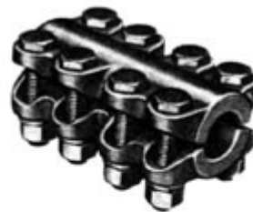
STTH Series Tube to Tube, Straight Bronze Bolted Couplers