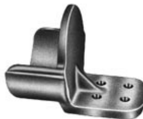
WSTF Series Tube to Flat Aluminum Weldment Terminals