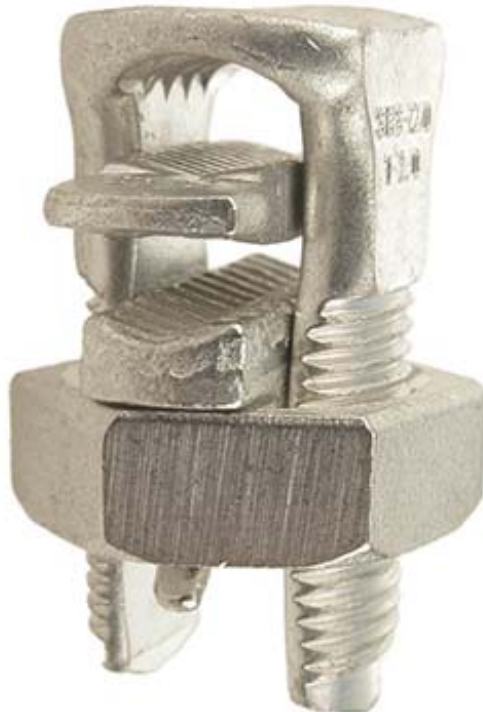
Copper Split Bolt Connector