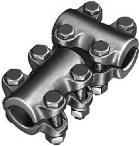
Tee, Aluminum Bolted, Cable to Cable, 1.382-1.632 Main to 0.563-0.744 Tap