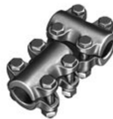
ATCC Series Cable to Cable Aluminum Bolted Tees