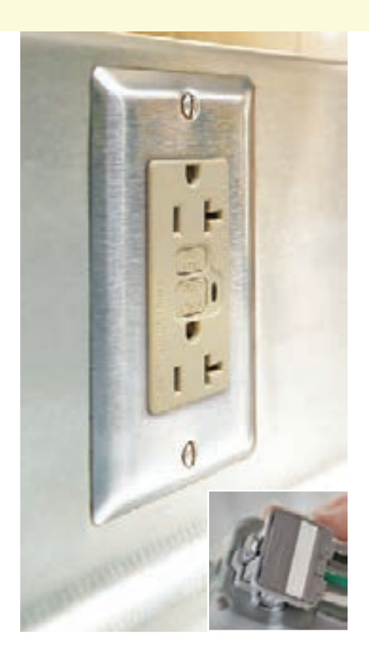
APPLICATION TIP... For maximum safety, patented SafeLock™ Protection shuts off power to the receptacle if there's a ground fault, if there's a miswire, or if GFCI protection is compromised.

Choose from a wide range of devices that save energy and protect critical equipment.