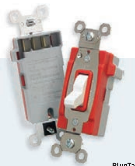
SPEC TIP . . . Specify glass-reinforced nylon switch back bodies for durability and strongest switch available.

Safe, durable, energy-efficient solutions for every school environment.