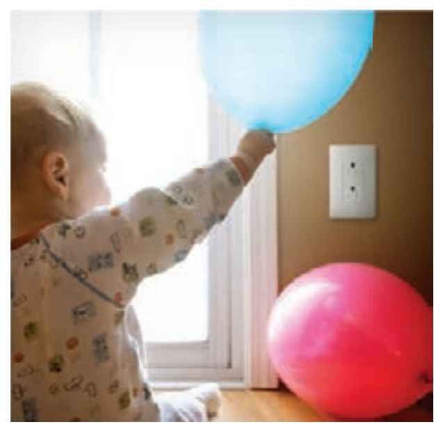
CODE TIP... 406.11 Tamper-Resistant Receptacles in Dwelling Units. In all areas specified in 210.52, all 125-volt, 15- and 20-ampere receptacles shall be listed tamper-resistant receptacles.

Meet the many demands of these settings with everything from tamper-resistant receptacles to commercial-grade GFCIs to sleek-looking lighting controls.