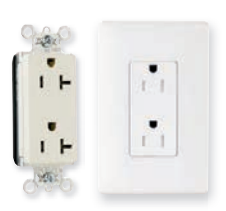
APPLICATION TIP . . . PlugTail™ Receptacles and Switches minimize downtime for busy theme parks and casinos.

provide fast, easy connections for stage and sound needs.