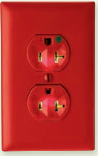
APPLICATION TIP ... Illuminated receptacles for emergency circuits to ID receptacles in emergency situations.