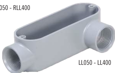
LLO50 - LL400