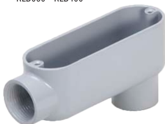
LB050 - LB400