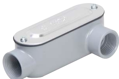
RLL050 - RLL400