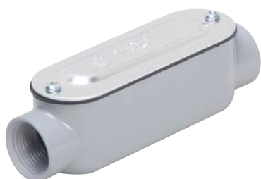
RLC050 - RLC400