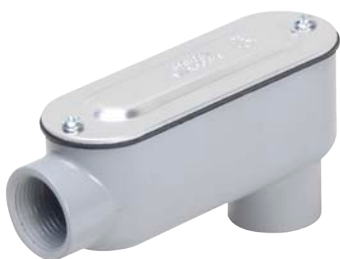
RLB050 - RLB400