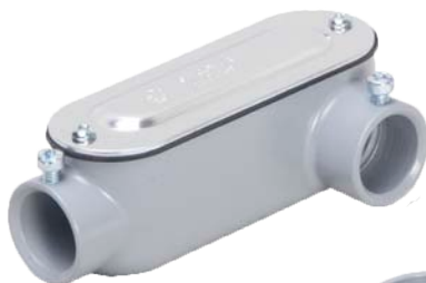
EALL050 - EALL400