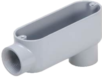
LB050 - LB400