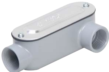
RLL050 - RLL400