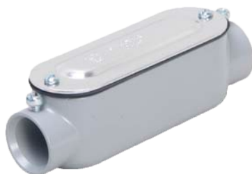
EAC050 - EAC400