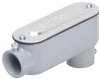
EALB050 - EALB400