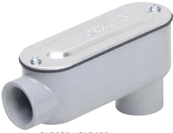
RLB050 - RLB400