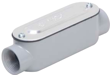
RLC050 - RLC400