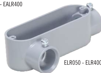
ELR050 - ELR400