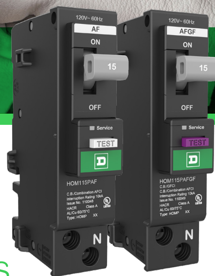
AF and AFGF dual function circuit breakers