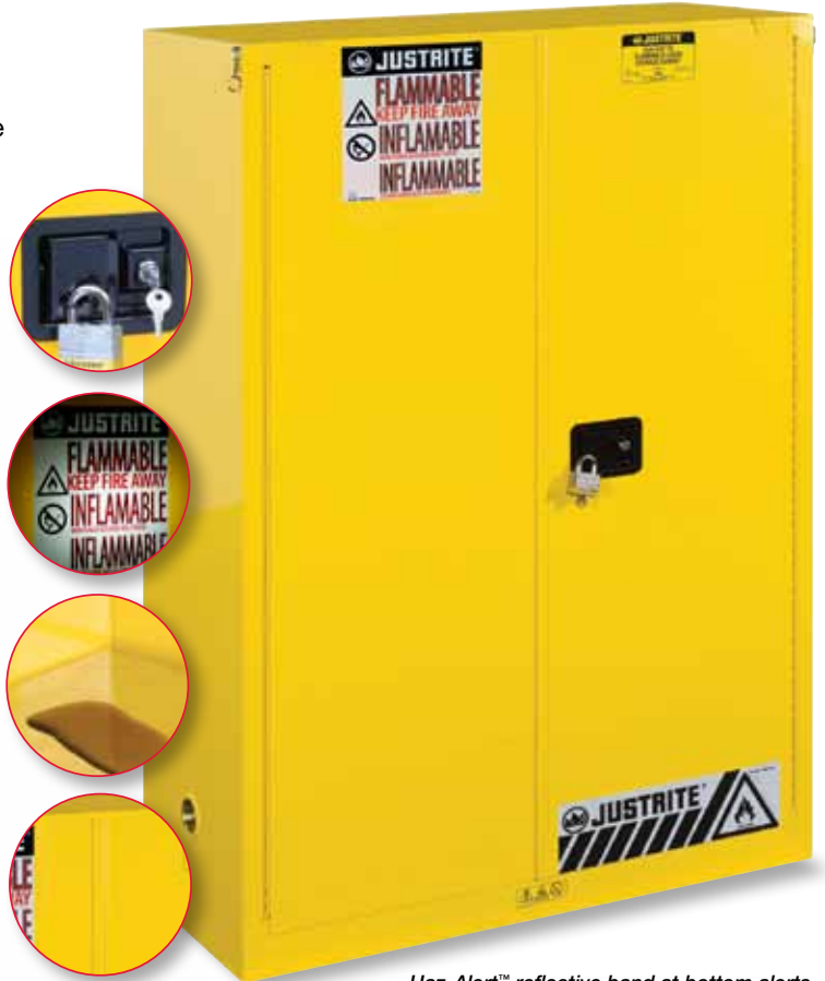
Haz-Alert™ reflective band at bottom alerts firefighters when crawling in smoke-filled areas.

Protect workers, reduce fire risks, and improve productivity by storing hazardous liquids in Sure-Grip ® EX safety cabinets. Designed to meet FM, OSHA, NFPA, and International Fire Code standards—depending on model—Justrite cabinets feature an all-welded, 18-gauge (1-mm) steel, double-walled construction, with 1½" (38-mm) air space. The insulating air space provides protection by maintaining a comparative lower temperature inside the cabinet where flammable or combustible materials are stored. Fail-safe, self latching doors with durable three-point stainless-steel bullet latches provide easy, positive door closure. The U-Loc™ door handle comes with an installed cylinder lock and two keys, and also accepts optional padlock for extra security. Self-close door styles include fusible links at top