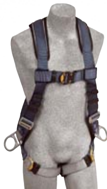
1108581 EXOFIT™ VEST-STYLE HARNESS Back and side D-rings, loops for belt, quick connect buckles. (XLarge) 1108575 Small 1108576 Medium 1108577 Large