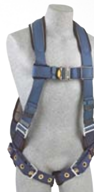
1109358 EXOFIT™ VEST-STYLE HARNESS Back D-ring, loops for belt, tongue buckle legs. (XLarge) 1109355 Small 1109356 Medium 1109357 Large