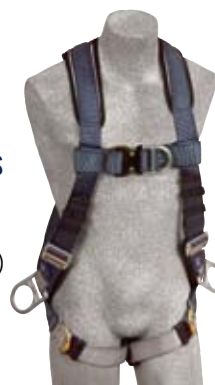
1108606 EXOFIT™ VEST-STYLE HARNESS Front, back and side D-rings, loops for belt, quick connect buckles. (XLarge) 1108600 Small 1108601 Medium 1108602 Large