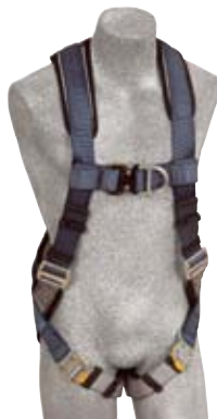
1108532 EXOFIT™ VEST-STYLE HARNESS Front and back D-rings, loops for belt, quick connect buckles. (XLarge) 1108525 Small 1108526 Medium 1108527 Large