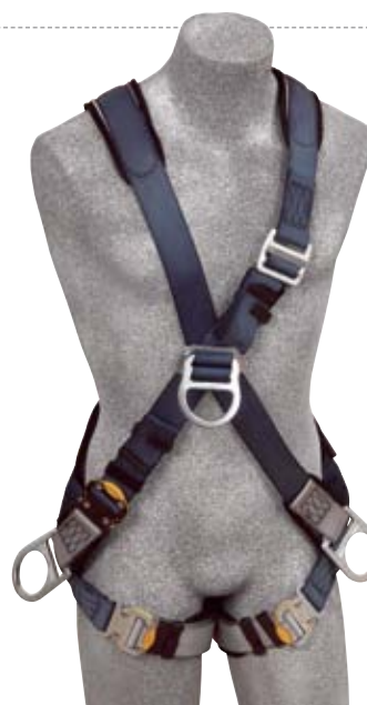
1108706 EXOFIT™ CROSS-OVER STYLE HARNESS Front, back and side D-rings, loops for belt, quick connect buckles. (XLarge) 1108700 Small 1108701 Medium 1108702 Large