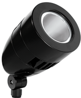
Bullet shape die cast aluminum flood with spotlighting for over 40 feet away. Color: Black Weight: 3.5 lbs