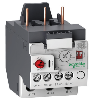
LR9D01 - LR9D32