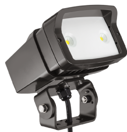
YK- Yoke mount