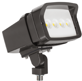
THK- Knuckle with 1/2" NPS threaded pipe