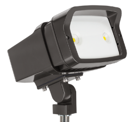
Vandal Guard (Polycarbonate lens) OFL1VG