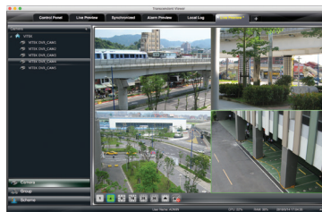
Remote Viewing Using Mac OS X