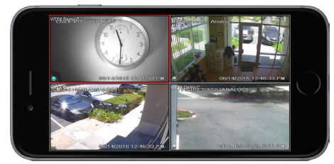
Apps Available for iPhone, iPad, & Android Devices