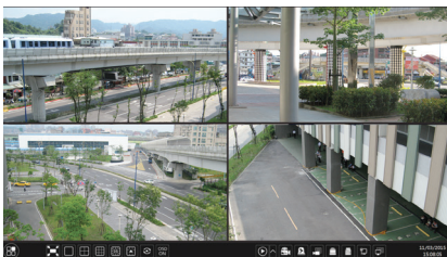
Local Management, Viewing Interface & Remote Viewing with Web Browsers