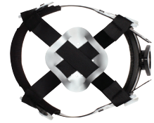
HPR541 – 4-point ratchet suspension