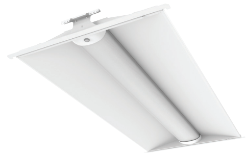
Optional Controls & Trim Shown