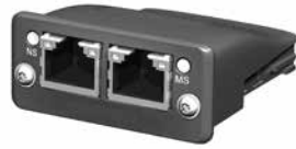
Active - (Industrial Ethernet)