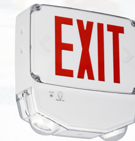
CWC Wet Location Exit/Emergency Light