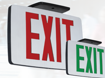
CCE Thin Die-Cast Exit