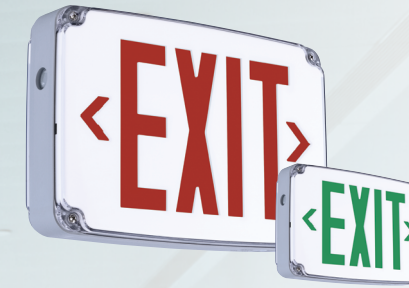
CEW Wet Location Exit