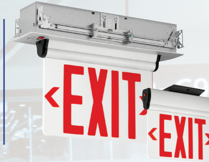
CEL Edge-Lit Exit