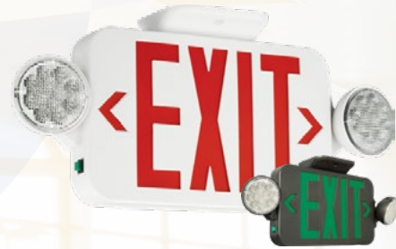
CC Combination Exit/Unit

Products with this icon have optional Self-Test/Self-Diagnostics available