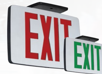
CCE Thin Die-Cast Exit