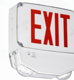
CWC Wet Location Exit/Emergency Light