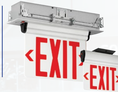
CEL Edge-Lit Exit