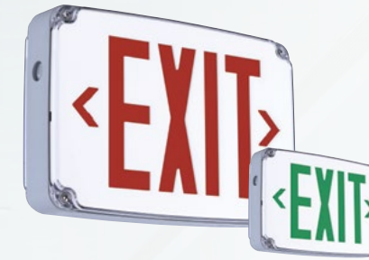
CEW Wet Location Exit