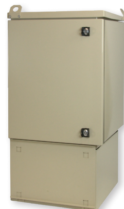
288 Fiber (Closed)