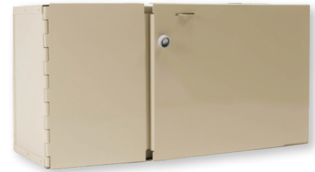
Mini IDC (Closed)