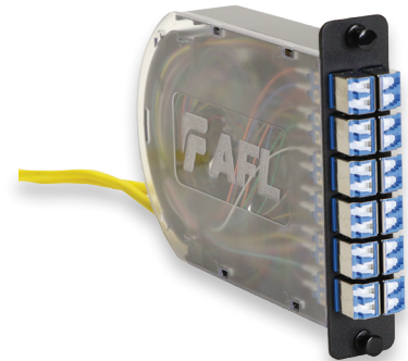
24-Fiber LC/UPC Configuration