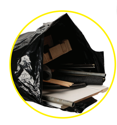
Flexible and durable