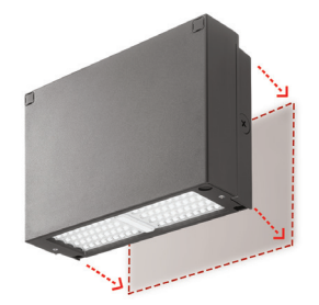
Geometric shape covers the footprint of a typical HID wall pack, covering any unsightly stains.