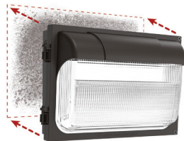
TWX2 LED Wall Pack

Modern low-profile design is less obtrusive on the wall but has a shape that covers the footprint of a typical HID wall pack, covering any unsightly stains.