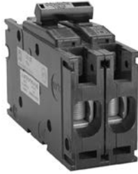
High Ampere QOU