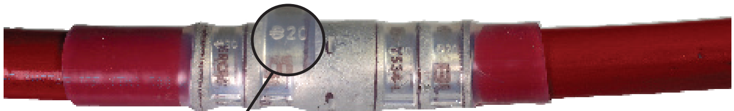
Inspectability to verify correct tool/die combination