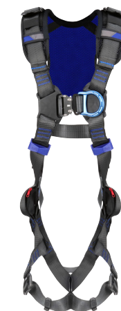
X-Style General Industry Climbing