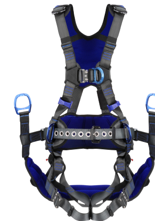
X-Style Tower Climbing (Telecommunications)