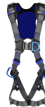
X-Style Climbing/Positioning (Wind Energy)