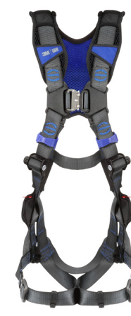
X-Style General Industry

Equipped with contoured form-fitting chest configuration to don easily in 'X' shape. X-Style harness buckle contours to your body, providing an optimal central connection. New horizontal leg straps complement the range of motion workers require on the jobsite.