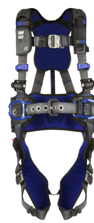
Construction Weight Distribution

Equipped with robust construction hip pad and lightweight back bar to redistribute weight and fatigue from shoulder area.