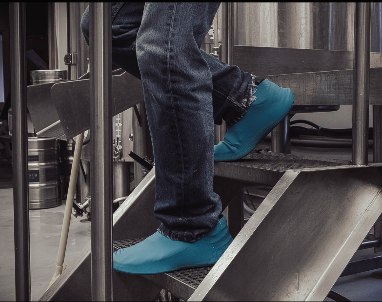
Boot Saver shoe covers are perfect for the color coded world of food processing by helping prevent cross-contamination.