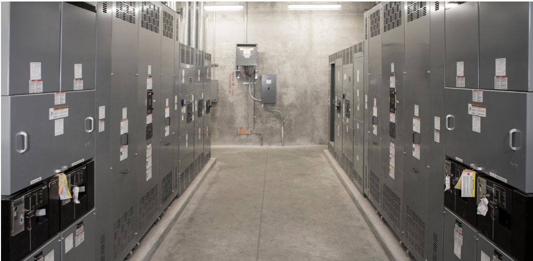
The switchgear structure, conduits, cabling and footprint are left intact, which saves time and money (above).

Retrofitting is a general term that is used to define any process which allows for modernization and life extension of electrical equipment. Several different retrofit strategies exist for adapting modern circuit breakers into existing low-voltage and medium-voltage switchgear structures.