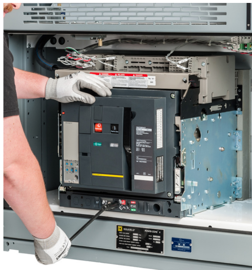
Aging or obsolete circuit breakers are replaced with state-of-the-art, modern circuit breakers, bringing the existing line-up to current technologies.