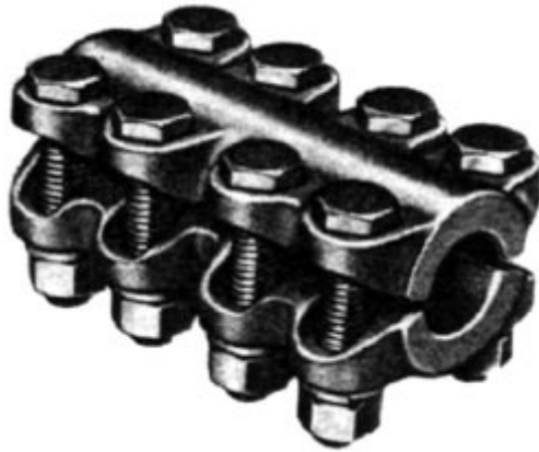
Coupler, Tube to Tube, Bronze Bolted, 3/4 to 3/4 IPS tubes