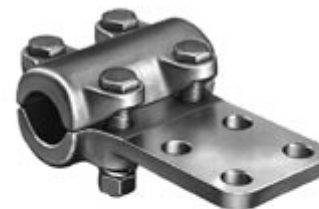
ATCF Series Cable to Flat Aluminum Bolted Tees