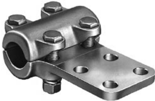
Tee, Aluminum Bolted, Cable to Flat, 0.87-1.108 Main to 3 in, 4 hole flat Tap