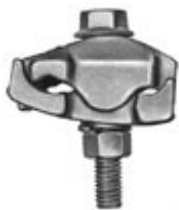
LC-50 Series Aluminum Center Bolt Parallel Groove Connector For AL to AL or AL to CU connections