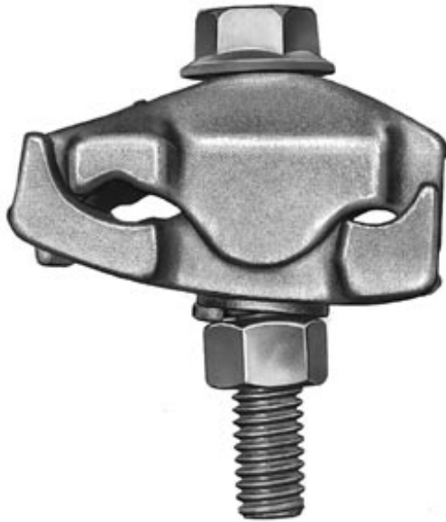
Single Center Bolt Aluminum Parallel Groove Connector