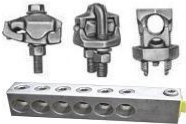
Mechanical Connectors For AL to AL or AL to CU connections