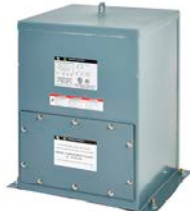
Style X—Type 4X Rated