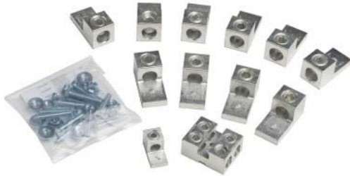
Table 14.12: Compression Lug Kits