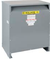
Style D and H—Type 2 Rated Converts to Type 3R with Weathershield