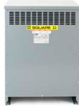
Style M—Type 2 Rated Converts to Type 3R with Weathershield