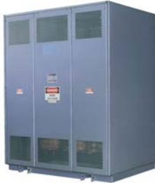
Style F—NEMA 1 Rated