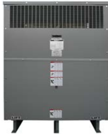
Style D, NEMA 1 Rated