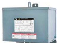
Style C—Type 3R Rated