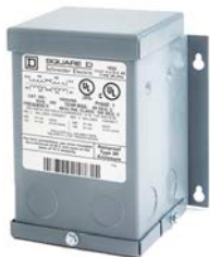
Style A—Type 3R Rated