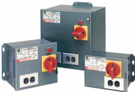
Transformer disconnects are available in NEMA Type 1 Standard, NEMA Type 12 Standard, and NEMA Type 1 Mini.

Contact local Schneider Representative for catalog number and quotation.