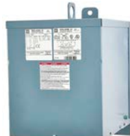
Style B—Type 3R Rated