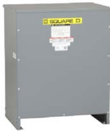
Style E—IP55 Rated