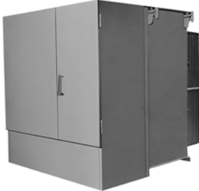
Liquid Filled Pad Mounted