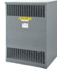
Style J—Type 1 Rated Converts to Type 2 with Drip Shield Converts to Type 3R with Weathershield