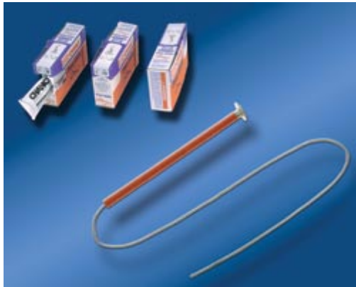
46.0 amp, Type SloFast Cutout fuselink with a 23" (584.2mm) pigtail.