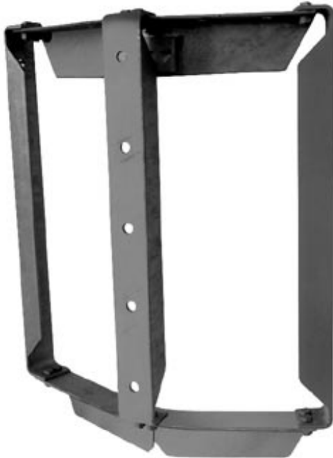
Bracket, Transformer, Wing-Rack Type