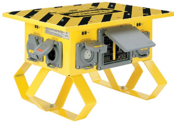
50A Spider II