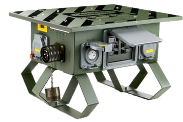
60A Class "L" Spider II