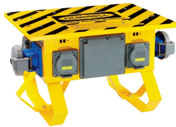
60A Spider II