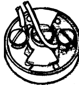
RECOMMENDED TERMINAL SCREW WIRE WRAP (WIRE ENTERS FROM INSIDE)

NOTE: THE LENGTH OF THESE DEVICES HAS BEEN ALTERED TO COMPLY WITH THE LATEST REQUIREMENTS OF UNDERWRITERS LABORATORIES, INC.