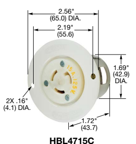
Dimensions in Inches (mm)