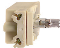
Incandescent light module