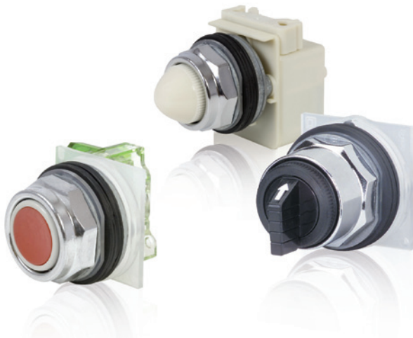
Attractive 9001K chrome-plated bezels for most robust applications (Rated IP66, Type 4).