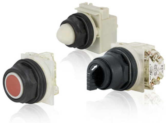
Double insulated, corrosion resistant 9001SK plastic bezels for oil, water and chemical applications (Rated IP66, Types 4X and 13).

With easy-to-install and identify features, the Harmony 9001K and 9001SK products deliver high performance and maximum flexibility to meet your most challenging requirements. Modular design and side-by-side mounting capability allow to optimize panel space and save installation time and costs.